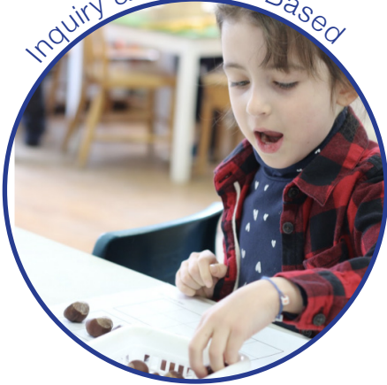
Inquiry & Concept Based